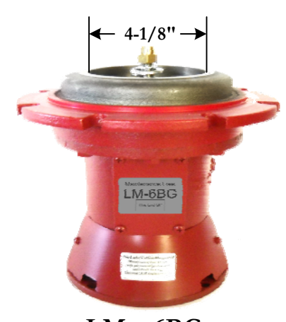
LM - 6BG