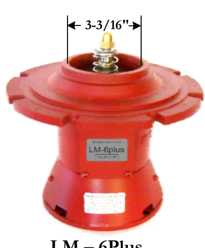
LM - 6Plus